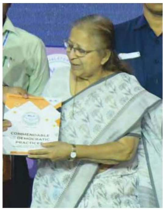
Patron Smt. Sumitra Mahajan unveiled the compendium on commendable democratic practices from other democratic countries