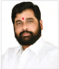
Shri. Eknath Shinde Maharashtra