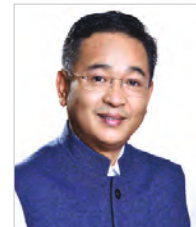
Shri. PS Goyal Sikkim