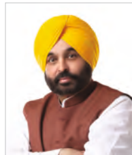
Shri. Bhagwant Singh Mann Punjab