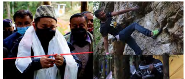
Picture 4 – Inaugural Ceremony of Inauguration of the GO Chakung Festival.

During his short conversation with the committee, he expressed his happiness in seeing the active participation of young entrepreneurs in promoting tourism and adventure sports in the state. The festival, organized by GO Chakung, aims to promote adventure sports and sustainable tourism in Soreng sub-division. It includes competitions such as MTB XC Race, Bouldering and Trail Running, as well as outdoor activities like Paragliding, Camping, Obstacle Course for kids, workshops, and games. Live music performances by renowned artists will also be featured.