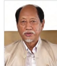
Shri. Neiphiu Rio Nagaland