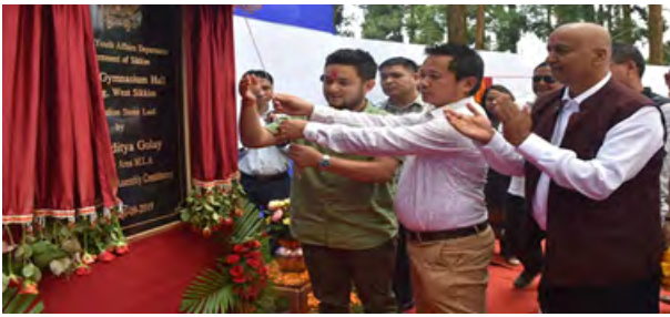
Picture 2 – Inaugural Ceremony of the Indoor Gymnasium Building at Soreng.

The Sports and Youth Affairs Department organized a Foundation Stone laying ceremony for the construction of an Indoor gymnasium building at Soreng, West Sikkim. The Hon'ble MLA Shri Aditya Golay was the Chief guest and appreciated the project funded by Khelo India. He mentioned that the project would cater to the needs of young and talented players of not just the Soreng-Chakung Subdivision but the State as well. The Project consists of a facility for Multi-Purpose Indoor Games with accommodation for 20 Boys and 20 Girls for residential events (refer Picture – 2).