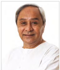
Shri. Naveen Patnaik Odisha