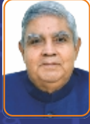
Shri. Jagdeep Dhankhar Hon'ble Vice President of Bharat