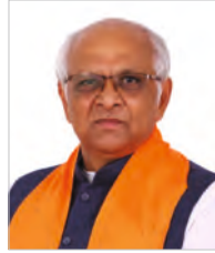
Shri. Bhupendra Patel Gujarat