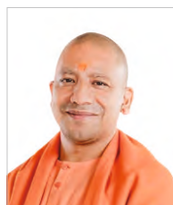
Shri. Yogi Adityanath Uttar Pradesh