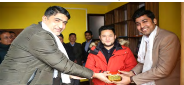
Picture 3 – Inaugural Ceremony of Chartered Accountant's Office at Soreng.