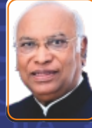
Shri. Mallikarjun Kharge Hon'ble Leader of Opposition, Rajya Sabha, President, Indian National Congress