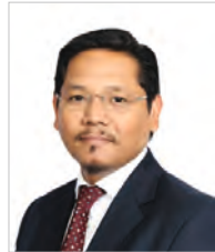
Shri. Conrad Kongkal Sangma Meghalaya