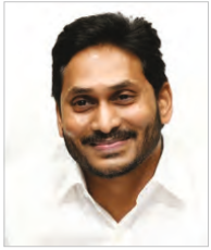
Shri. YS Jagan Mohan Reddy Andhra Pradesh