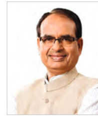
Shri. Shivraj Singh Chouhan Madhya Pradesh