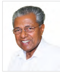
Shri. Pinarayi Vijayan Kerala