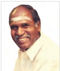
Shri. N. Rangaswamy Puducherry (UT)