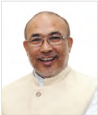
Shri. N. Biren Singh Manipur