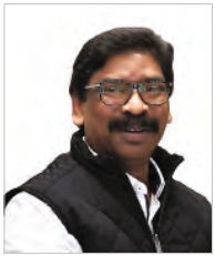
Shri. Hemant Soren Jharkhand