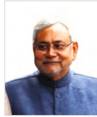
Shri. Nitish Kumar Bihar