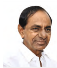
Shri. K Chandrashekar Rao Telangana