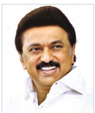
Shri. M. K. Stalin Tamil Nadu