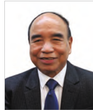
Shri. Pu Zoramthanga Mizoram