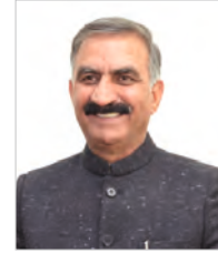
Shri. Sukhvinder Singh Sukhu Himachal Pradesh