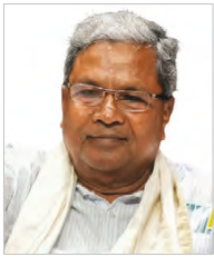
Shri. Siddaramaiah Karnataka