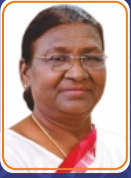
Smt. Droupadi Murmu Hon'ble President of Bharat

— Leading Lights of our Present Democracy —