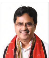
Dr. Manik Saha Tripura