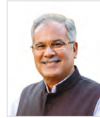
Shri. Bhupesh Baghel Chhattisgarh