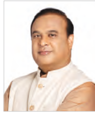
Shri. Himanta Biswa Sarma Assam