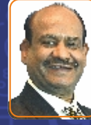
Shri. Om Birla Hon'ble Speaker, Lok Sabha