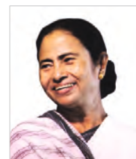
Km. Mamata Banerjee West Bengal