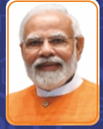
Shri. Narendra Modi Hon'ble Prime Minister of Bharat