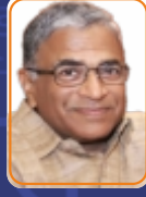
Shri. Harivansh Hon'ble Deputy Chairman, Rajya Sabha