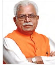
Shri. Manohar Lal Haryana