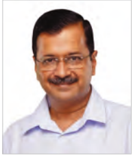
Shri. Arvind Kejriwal Delhi (NCT)