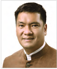
Shri. Pema Khandu Arunachal Pradesh