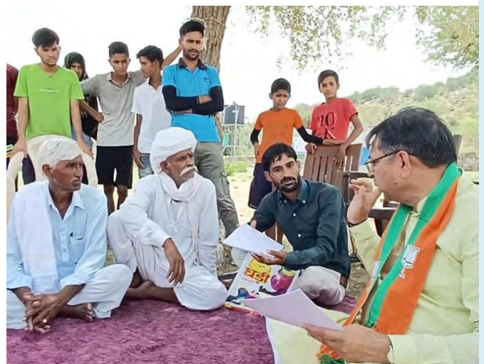
Yojna, works worth Rs 43.89 lakh were done in Sewapura, Chandwaji, Nangal Purohit, Nangal