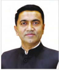
Shri. Pramod Sawant Goa