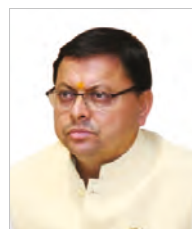
Shri. Pushkar Singh Dhami Uttarakhand