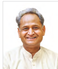
Shri. Ashok Gehlot Rajasthan